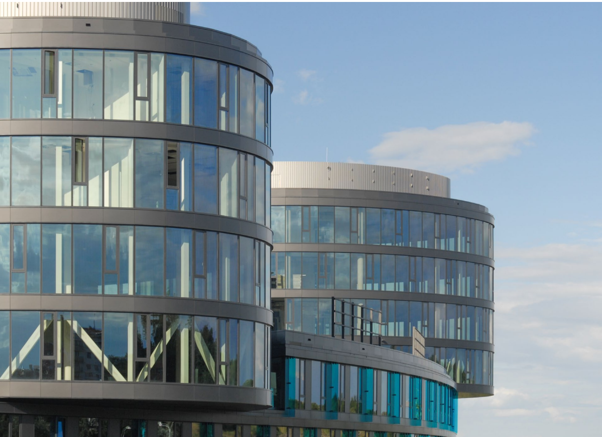
Office Building Aviatica, Prague, Czech Republic